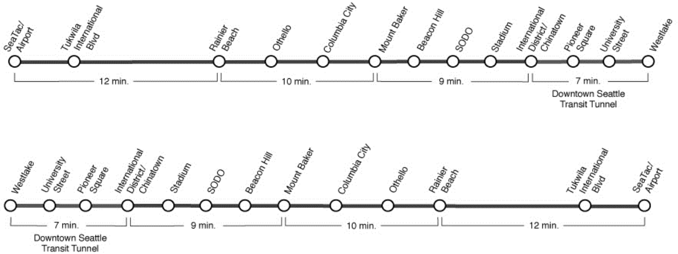
Approximate Departure Intervals for Each Station